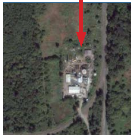
4242 ALDERGROVE ROAD

This document has been prepared by Colliers International for advertising and general information only. Colliers International makes no guarantees, representations or warranties of any kind, express or implied, regarding the information including, but not limited to, warranties of content, accuracy and reliability. Any interested party should undertake their own inquiries as to the accuracy of the information. Colliers International excludes unequivocally all inferred or implied terms, conditions and warranties arising out of this document and excludes all liability for loss and damages arising there from. This publication is the copyrighted property of Colliers International and /or its licensor(s). © 2008. All rights reserved.